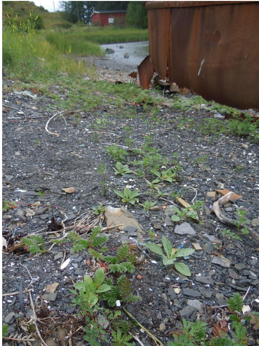
Phot.1. Vegetative plants on the location 1, close to boat wreck. 30.06.2014