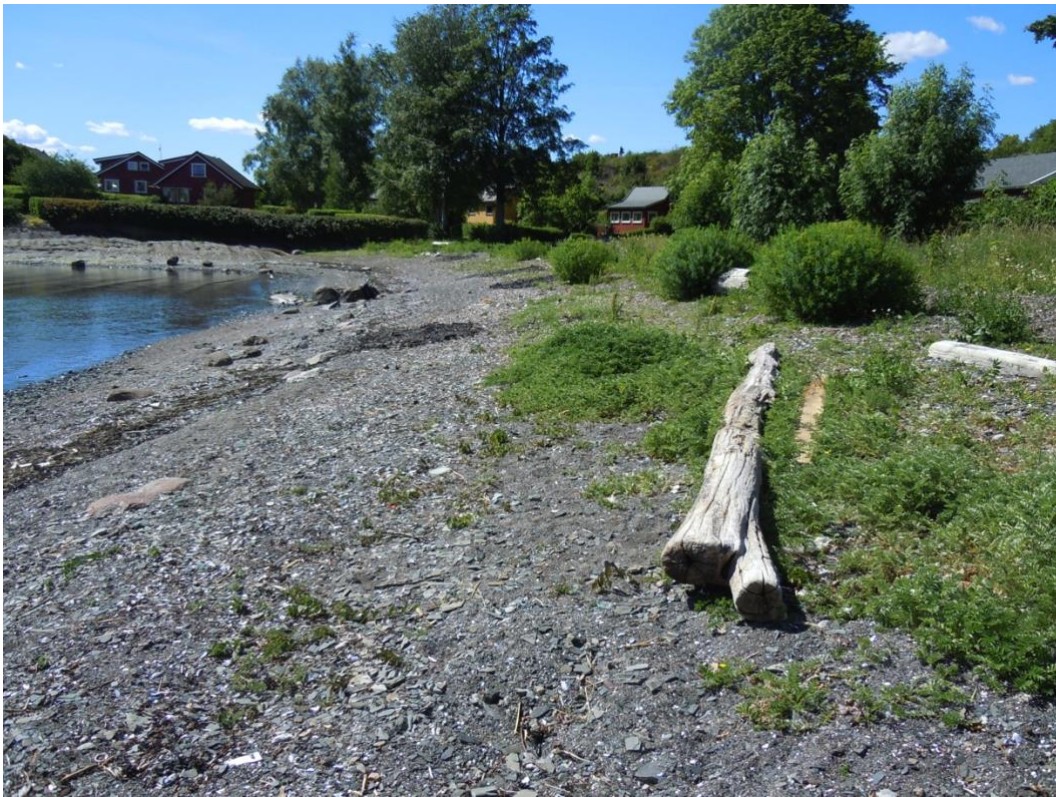
Phot.2. Western part of a beach with vegetative Hyoscyamus plants. 18.06.2014